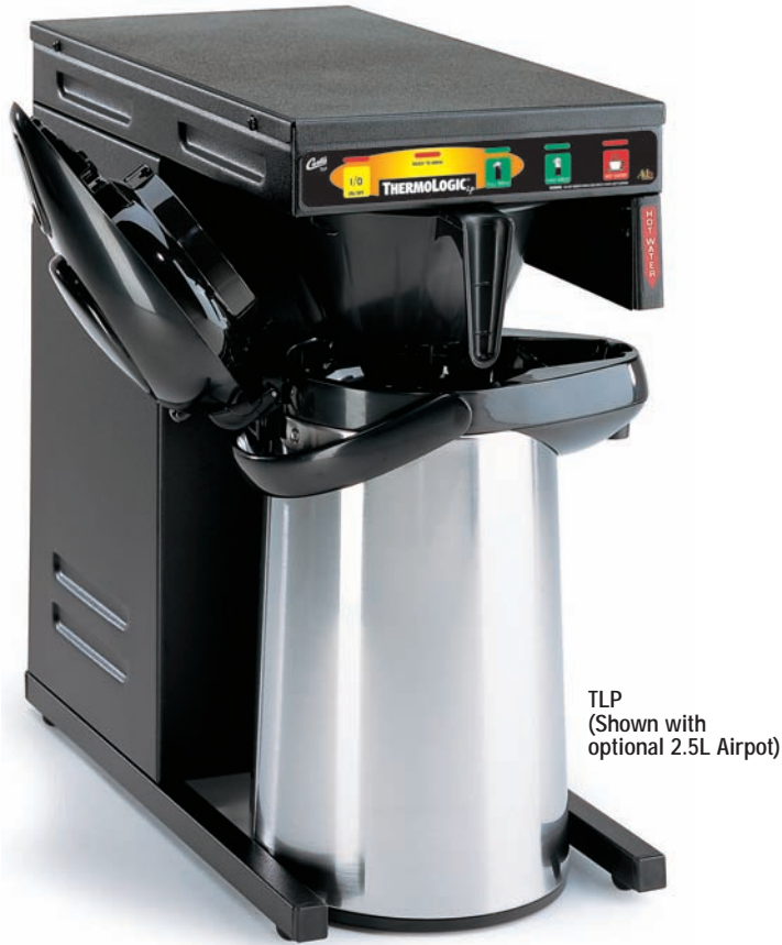
TLP (Shown with optional 2.5L Airpot)