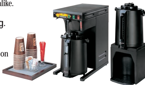
TLP (Shown with optional Gravity Airpot)

The TLP series simplifies the brewing process with standout features. At a glance, the Ready-to-Brew light turns on when the system is set to brew. A handy Hot Water Faucet lets you draw piping hot water anytime.